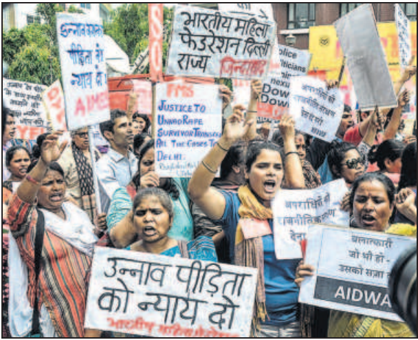
■ Members of All India Democratic Women’s Association and others protest against UP CM Yogi Adityanath after the Unnao rape victim’s car accident, outside UP Bhawan in New Delhi on July 30.

Uttar Pradesh legislator Kuldeep Singh Sengar, who was expelled by the Bharatiya Janata Party (BJP) last month, raped her in 2017 when she was a minor.